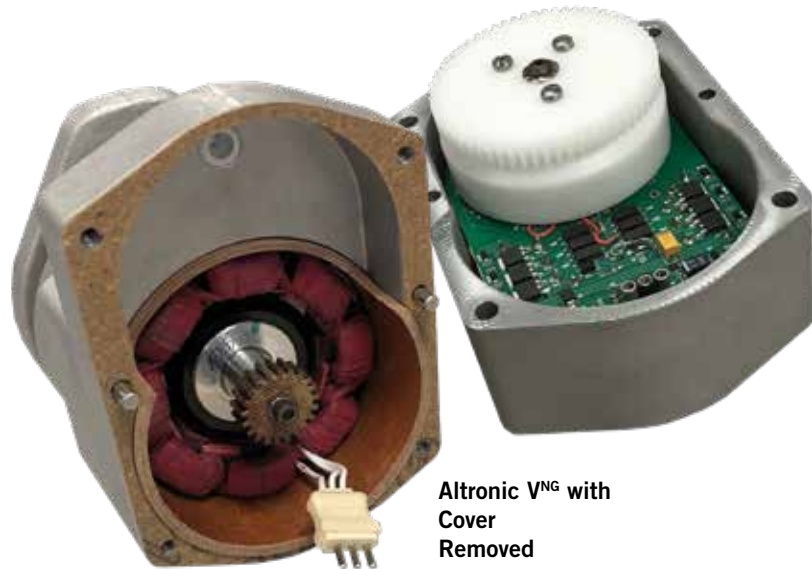
Altronic V NG with Cover Removed

Altronic V NG shares a maintenance free design with the original Altronic V, which counts thousands of units in successful field operations since 1981. Internal gears are large and underloaded, so when service is required, Altronic V NG makes it easy. All electronic components are mounted on the back cover assembly which is easily removed from the alternator section of the unit.