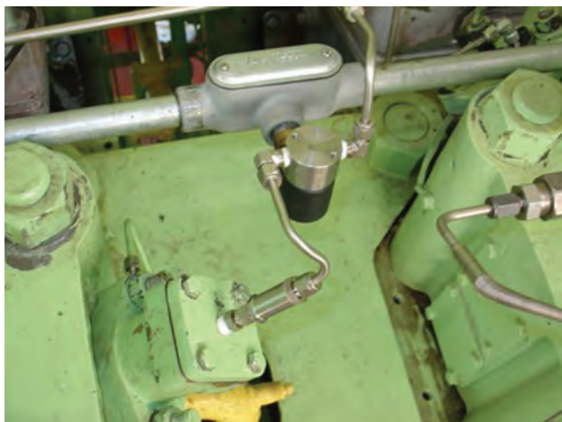
Pneumatic air distributor with pilot-actuated air-in-head valve