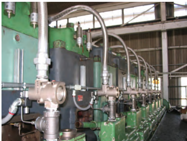
Cam actuated start valves with pressure-actuated in-head check valves

Installation of the SaveAir system on engines with an existing pneumatic air distributor (OEM or aftermarket) and pilot actuated in-head starting valve represents the least complex installation requirements to the user.